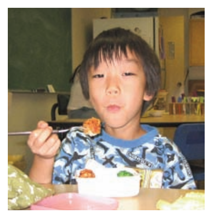
Children bring their own lunch. Milk is provided at all meals.

Morning and afternoon snacks are provide daily. Snacks are planned with the children's nutritional needs in mind.