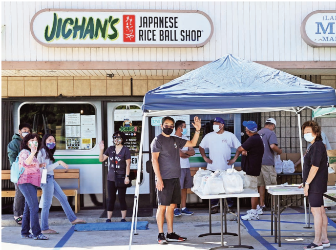
Dharma School Parents (DSP) fundraiser ready to distribute onigiri sets pre-ordered from Jichan's Onigiriya in Monterey Park.