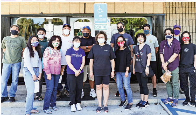
The DSP (& students) Onigiri Crew