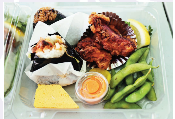
Karaage Combo Set: (clockwise) 2 varieties of onigiri, karaage, edamame, spicy miso aioli, and tamagoyaki