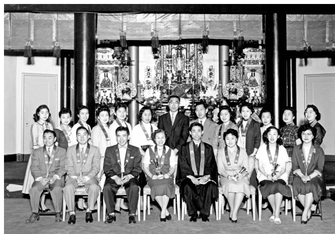
1957 Sunday School Teachers Staff

We have many participating groups this year with a variety of games and lots of food to eat. The various booths available this year are Nickel Toss on plates, Balloon Darts, Ring Toss on coins, Tic Tac Toe, Dime pitch, Nickel Pitch, Under 12- Over 22, Penny Pitch, Panda Pitch, Coke Bottle Toss, Ping Pong Toss, Record Pitch, Fishing, Lucky Strike, Shoyu Pitch, Dime Pitch on Electrical Board, Add-on-up Darts, Gold Fish Toss. Food concessions are sushi, corn dog, corn on the cob, snack bar, tamale and