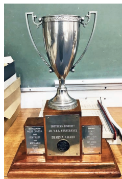
Dharma Award Trophy awarded to Nishi Jr YBA for year 2021