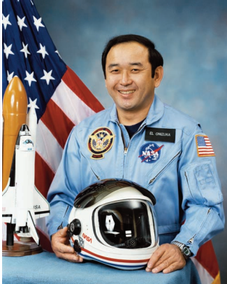
Ellison Shoji Onizuka NASA Astronaut

The 20th year (Buddhist 21st year) memorial service for the late astronaut, Ellison Onizuka was held at the Betsuin. Onizuka, a Jodo Shinshu Japanese-American who grew up in Hawaii, perished in the tragic explosion of the Space Shuttle Challenger in January 1986.